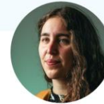
Liselotte de Ligne